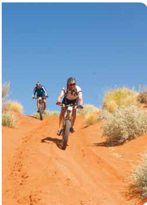
Making the most of the 'weee' on the leeward side of the dunes.