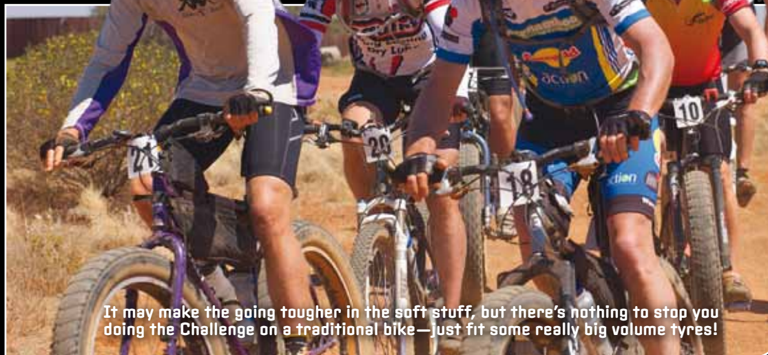
It may make the going tougher in the soft stuff, but there's nothing to stop you doing the Challenge on a traditional bike—just fit some really big volume tyres!