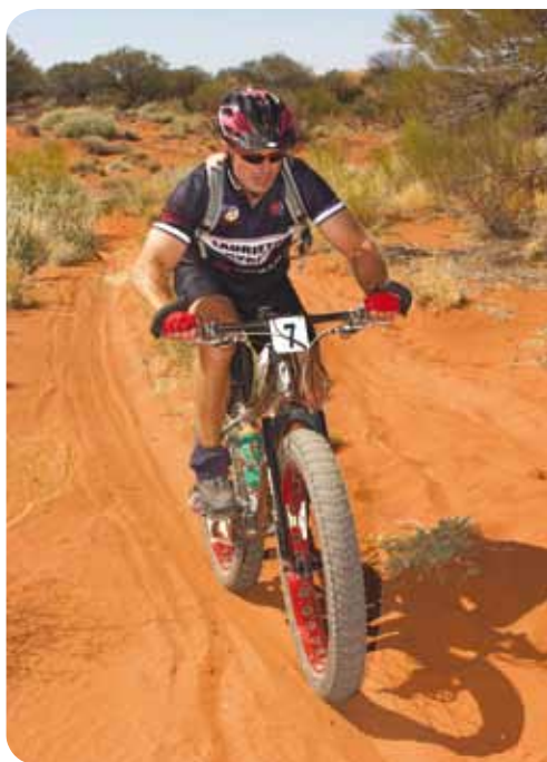
Fatbikes are now hugely popular at the Simpson Challenge.

For 25 years the Simpson Desert Bike Challenge has been run as a not-for-profit bike race, with funds currently going to the Royal Flying Doctors Service. For more information on the event and how to get involved go to: www.desertchallenge.org