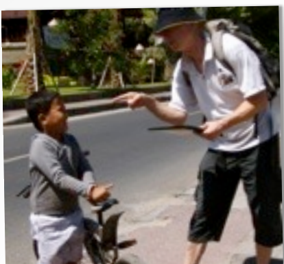
PUNISHMENT EVEN FOR KIDS