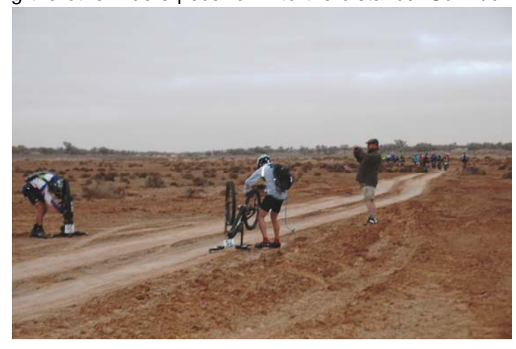
The field departs leaving me (left) and another unhappy camper to attend to very urgent repairs

Some of the support crews gathered around however were unable to help due to the fact I was two metres over the bloody start line and therefore into the race; no assistance could be provided by "outsiders". No worries, I'd had plenty of "tyre practice" by now and folded the tyre back on to the rim, pumped it up and was on my way within a minute... just like they do in La Tour... I