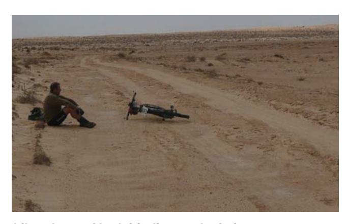
Like a lump of lard, frizzling on the frying pan

After a km or two caught I up with Alisha (#25), and we literally pushed ourselves to the 15km water stop where four other riders were sprawled under the awning having thrown in the towel.